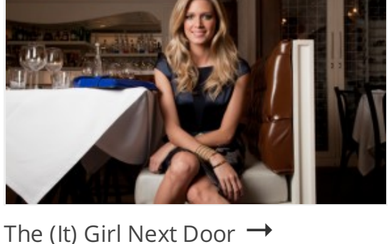
The (It) Girl Next Door →