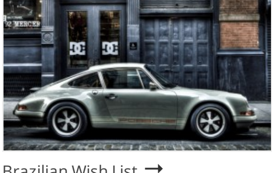
Brazilian Wish List →