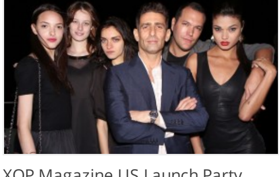
XOP Magazine US Launch Party event @ Jimmy at the James Hotel →