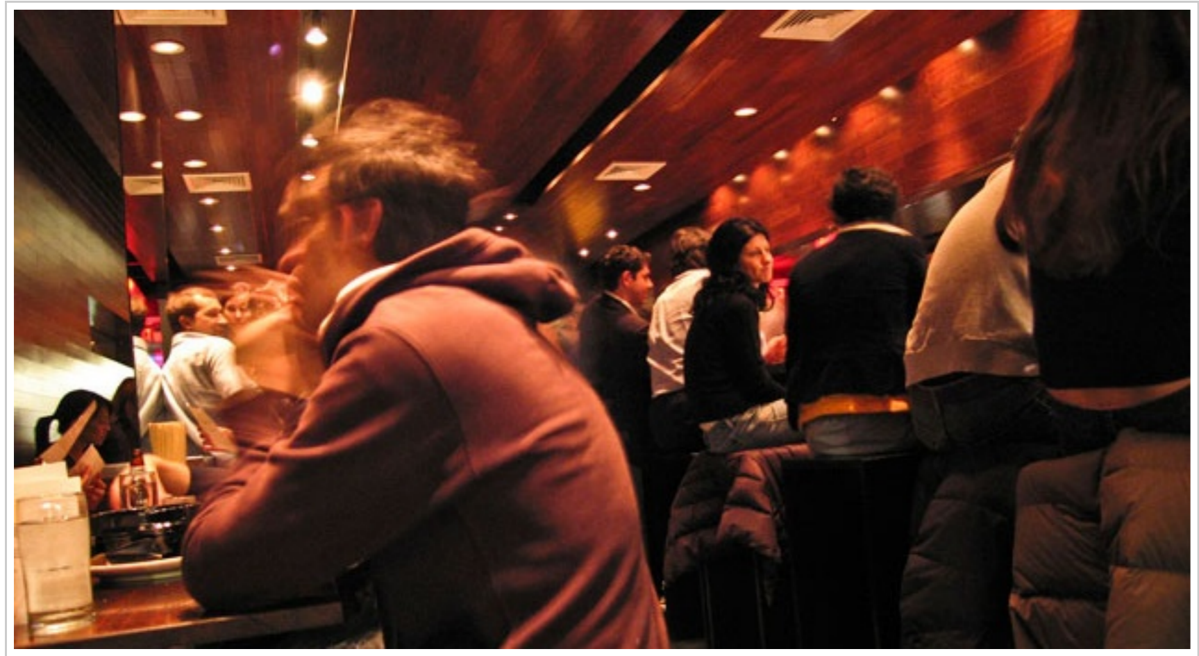
Momofuku, in New York City, is a bustling hotspot for Korean-fusion dishes.

By Jamie Beckman, Wednesday, Aug 29, 2012, 8:00 AM | Subscribe to the magazine